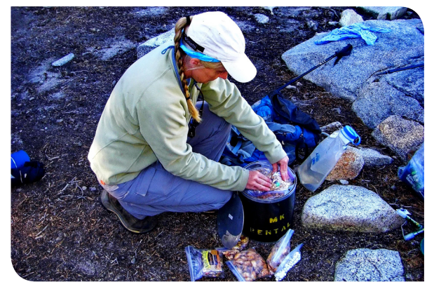
Camper packing food into a secure canister.

Activities vary by their potential to disturb wildlife. Activities that involve high speeds and loud sounds have a greater potential to disturb wildlife because of the substantially greater areas affected (Knight and Cole 1995). For example, motorized activities, mountain biking, and trail running have been cited as having a greater potential to startle and scare wildlife