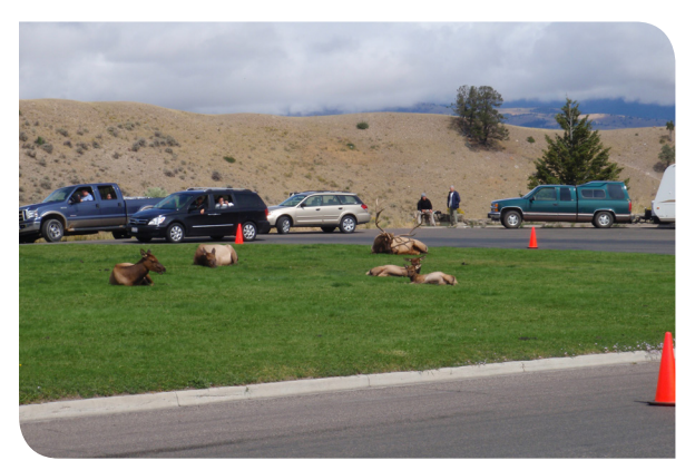
Visitors view elk enjoying green space.

In a study of mammals, bighorn sheep increased their avoidance responses to hikers as the number of negative encounters increased (King and Workman 1986). In a more recent study, Papouchis and others (2001) found substantial variation in responses of bighorn sheep to varying levels of visitor use; some animals habituated to the high-use areas while other animals consistently avoided these areas. The habituated animals had fewer responses to vehicles and mountain bikers compared to the habitats having lower visitor use. For the local population, there was an avoidance of the road and high visitor use area, representing 15% less use of suitable habitat compared to the low-use area. Sensitivity to hikers increased for males during the autumn rut period and for females during spring lambing.