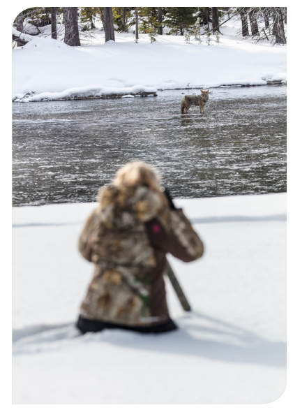
Visitor photographs wildlife (wolf).

Respect Wildlife. In addition to storing all food, trash, and smellables throughout the trip and never feeding wildlife, this Leave No Trace principle encourages visitors to respect wildlife, as the recreationists are visitors to the wildlife's home. This includes observing wildlife from a distance by using binoculars and telephoto lenses, halting an approach to wildlife if they react to your presence, practicing guiet nonthreatening behaviors, and avoiding sensitive areas and times, such as when wildlife are nesting, giving birth, raising young, or coping with wintertime snow and cold weather. This principle also emphasizes leaving pets at home or restraining them at all times with a leash.