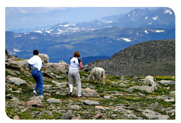
Visitors taking photographs of wildlife (mountain goats).

Knight and Cole (1995) attribute the learned component of wildlife responses to humans to the number and outcome of prior interactions between individual wildlife and humans. A number of studies reveal that wildlife readily learn and adapt to visitor intrusions to their habitats. In a Minnesota bald eagle study, the approach distance at which eagles flushed increased as repeated observers approached their nests (Fraser et al. 1985). Nesting adults