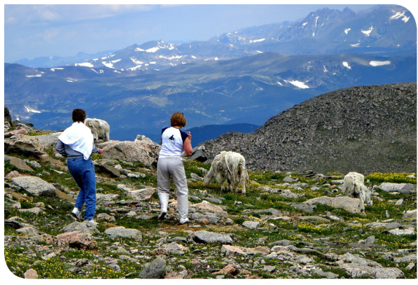
Visitors taking photographs of wildlife (mountain goats).