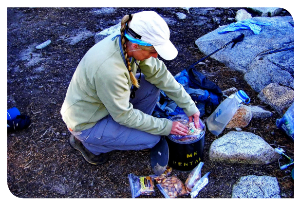
Camper packing food into a secure canister.

than slower trail activities, such as hiking and nature observation (Knight and Gutzwiller 1995). However, some recent studies have found less impact from motorized uses, suggesting that wildlife are more threatened by the human form, which can be masked when visitors travel in or on vehicles, or suggesting that nonmotorized visitors are able to more closely approach and surprise wildlife before being detected (Larson et al. 2016).