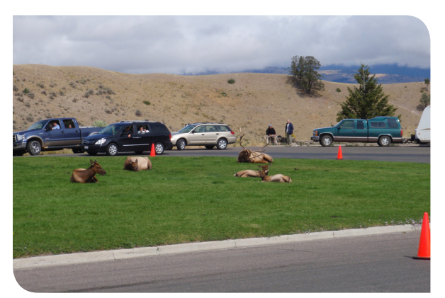
Visitors view elk enjoying green space.

In a study of mammals, bighorn sheep increased their avoidance responses to hikers as the number of negative encounters increased (King and Workman 1986). In a more recent study, Papouchis and others (2001) found substantial variation in responses of bighorn sheep to varying levels of visitor use; some animals habituated to the high-use areas while other animals consistently avoided these areas. The habituated animals had fewer responses to vehicles and mountain bikers compared to the habitats having lower visitor use. For the local population, there was an avoidance of the road and high visitor use area, representing 15% less use of suitable habitat compared to the low-use area. Sensitivity to hikers increased for males during the autumn rut period and for females during spring lambing.