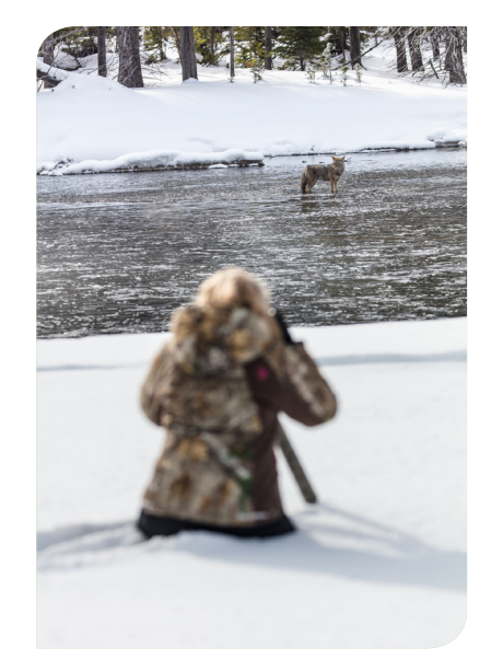
Visitor photographs wildlife (wolf).

Respect Wildlife. In addition to storing all food, trash, and smellables throughout the trip and never feeding wildlife, this Leave No Trace principle encourages visitors to respect wildlife, as the recreationists are visitors to the wildlife's home. This includes observing wildlife from a distance by using binoculars and telephoto lenses, halting an approach to wildlife if they react to your presence, practicing guiet nonthreatening behaviors, and avoiding sensitive areas and times, such as when wildlife are nesting, giving birth, raising young, or coping with wintertime snow and cold weather. This principle also emphasizes leaving pets at home or restraining them at all times with a leash.